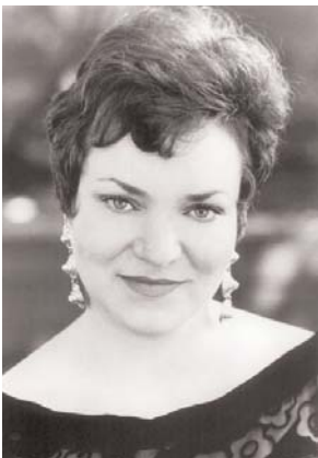
Dominique Labelle, soprano